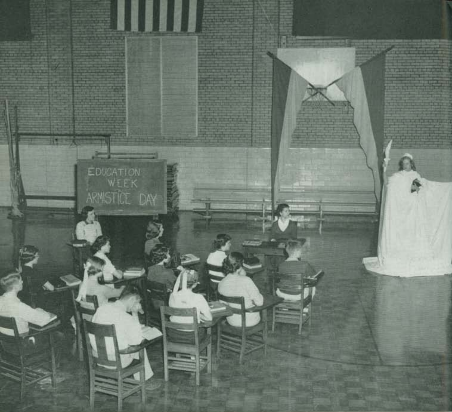
Assemblies throughout the year brought diversion.