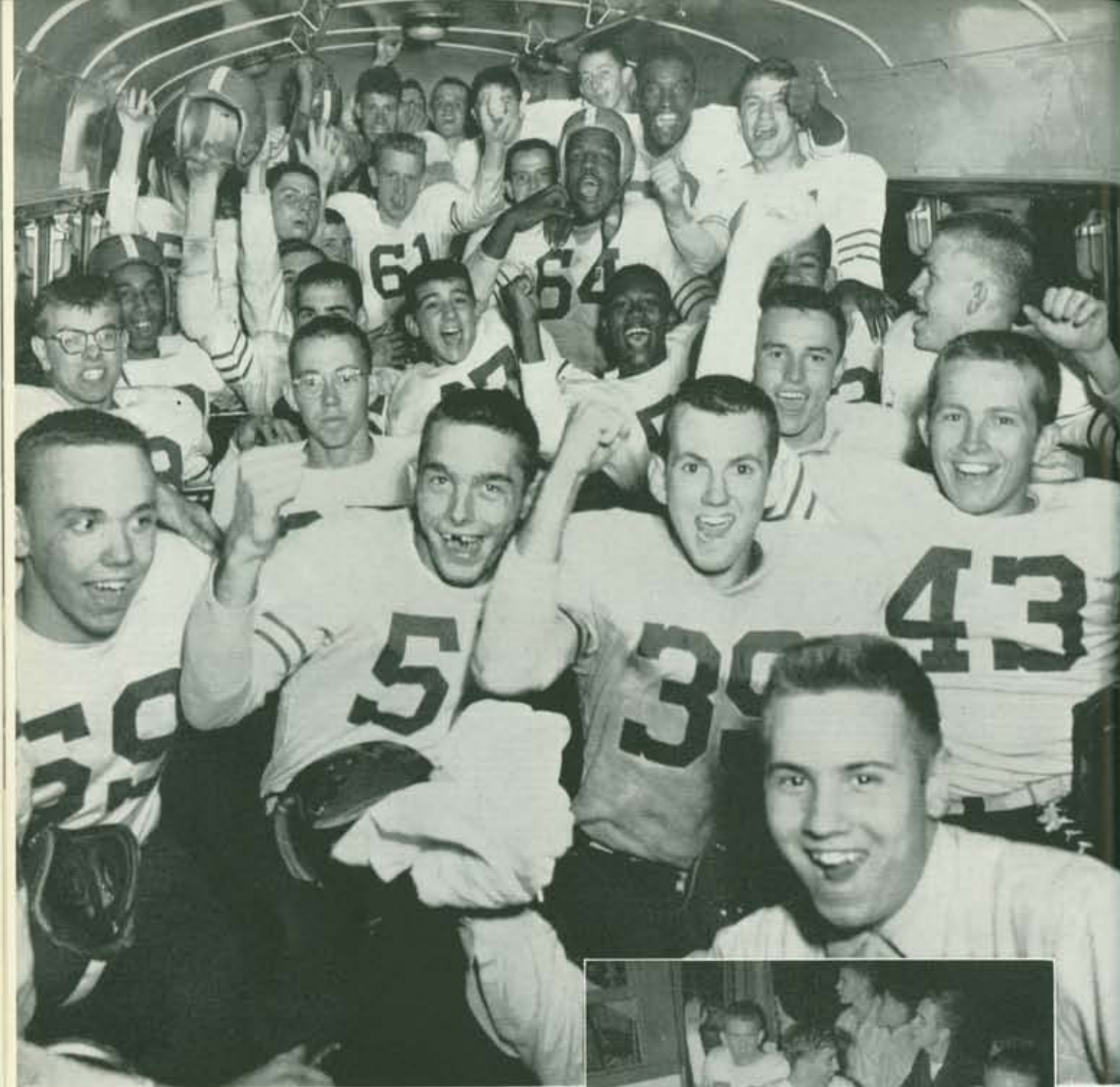
The bus ride home seemed short to the victorious teams.