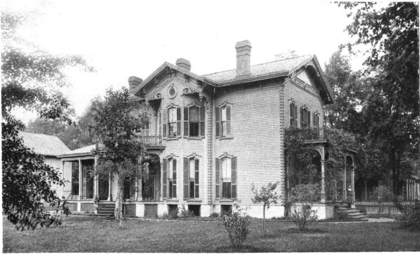
RESIDENCE OF J. A. PARKER.

this city of the dead is crowded; and the whole of this large tract of ground is thickly studded with the marble and granite memorials of the dead. On a pretty knoll by the river, south of the Vandalia railroad, are a few time worn and crumbling stones which mark the solitary graves of some early settlers. This was the site of the cemetery before Woodland was opened some fifty years ago. Highland Lawn cemetery, ten miles east of the city, is a beautiful site. It has hill and valley, offering opportunity for the landscape gardening which will in time make this equal to any cemetery in the State.