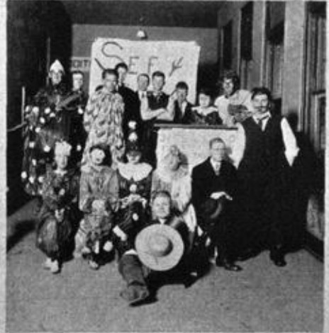
BENNY CARNIVAL 1915