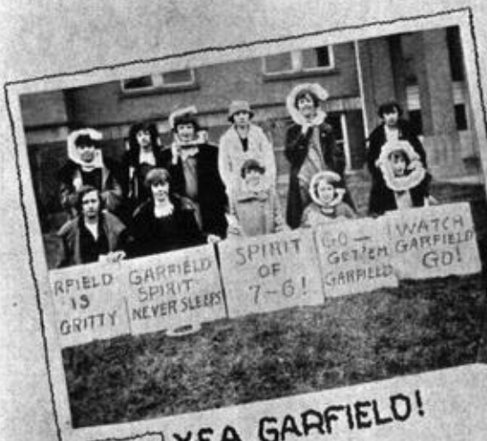
☐ YEA GARFIELD! ☐