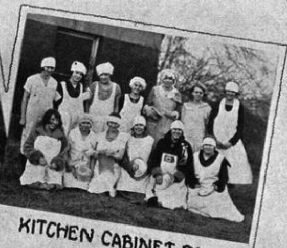
KITCHEN CABINET BAND ☐