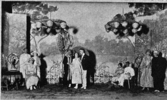
OPERETTA "YOKOHAMA MAID" 1918