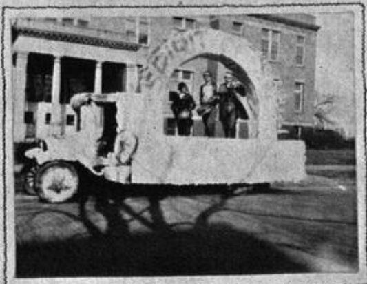
☐ FACULTY FLOAT ☐