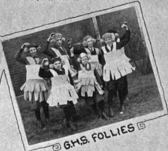
☐ G.H.S. FOLLIES ☐