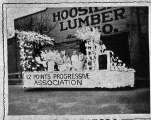
☐ OUR BOOSTERS ☐