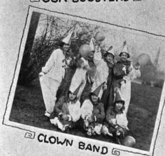
☐ CLOWN BAND ☐