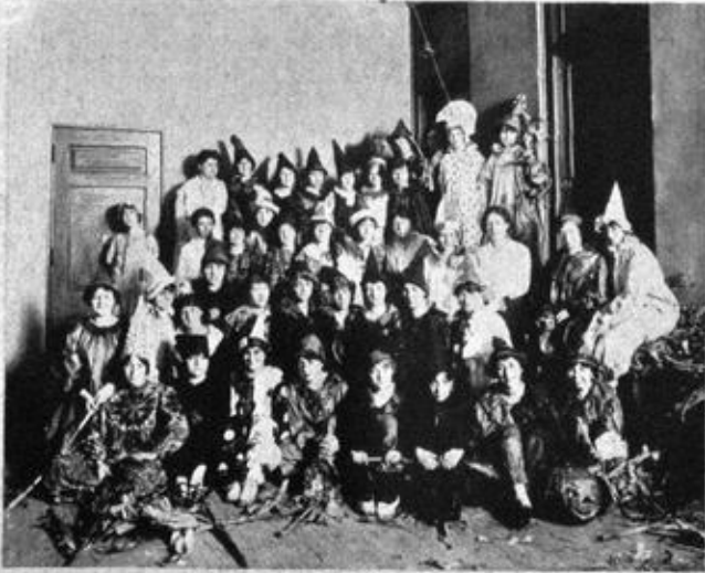
SENIOR GIRLS' CLUB 1916